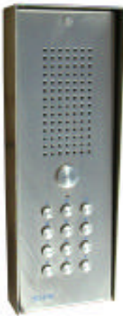
100 mm wide