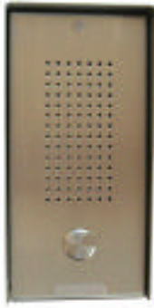
100 mm wide